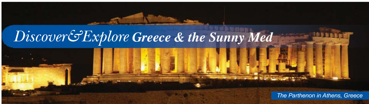
The Parthenon in Athens, Greece