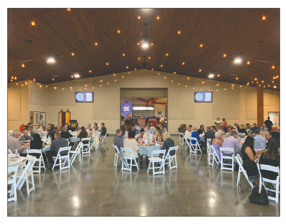
2021 Annual Banquet

As we continue to fight this global pandemic, you can be sure that the Centralia-Chehalis Chamber of Commerce will continue to support and promote our community and businesses. Please enjoy these photos from some of last year's events!