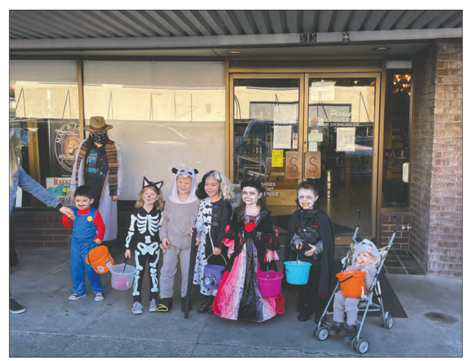
Trick or Treat Transit