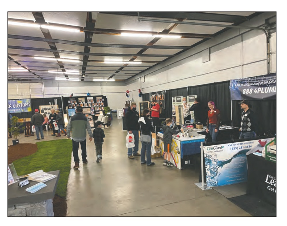
56th Annual Home & Sportsman Show