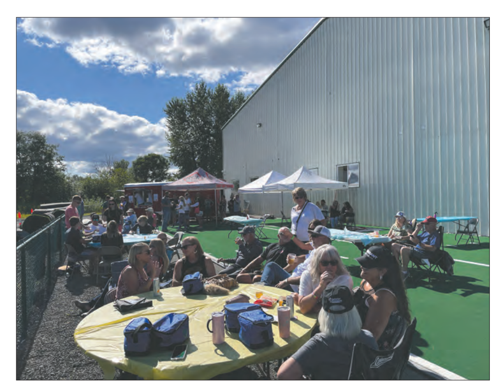
Virtual STP/Summer Concert