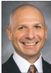
Rep. Peter Abbarno