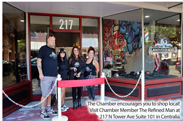
The Chamber encourages you to shop local! Visit Chamber Member The Refined Man at 217 N Tower Ave Suite 101 in Centralia.

that over $9.3 billion would stay in local economies if every family in the United States spent $10 a month at a local business. That same study reported that small business owners donate 250% more to local nonprofits and charitable organizations than larger out-of-town businesses.