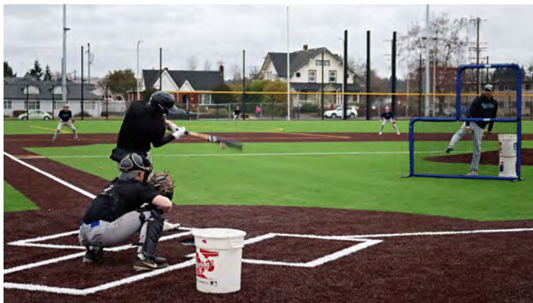
Centralia College Baseball team practices for the first time on the new Multisport Athletics Complex.