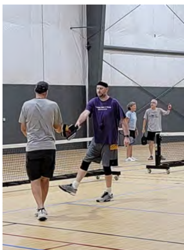
Pickleball players compete at The Northwest Sports Hub.

trips to local entertainment, historical bus tours and they are also turfing the in-fields currently. Sharing the same mission The Northwest Sports Hub and The Twin Cities Sports Commission are both working to make our community the sports capital of the Northwest. To find out more about The Northwest Sports Hub visit www.nwsportshub.com . To learn more about the Twin Cities Sports Commission visit www.twincitiessportscommission.org .