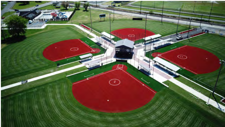
An aerial photo of the Chehalis Sports Complex.