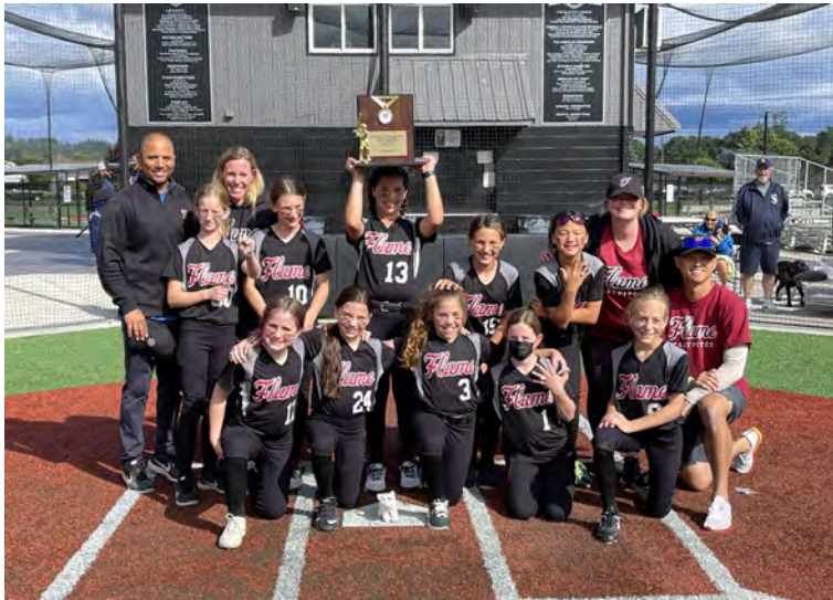
Flame Team photo (from Seattle) taken at the 10 & Under USA Softball Tournament held at the complex Summer 2022.

Renovations started in 2019 and were completed in 2020. The fields really started being used in 2021. The field complex was renovated from a dirt field to a state-of-the-art ballfield complex featuring artificial turf infields and grass outfields which will allow more scheduling of youth softball and baseball tournaments in Spring