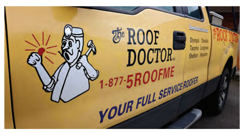
The iconic Roof Doctor logo on the side of a work truck.

is located at 1522 Bishop Rd. in Chehalis. Find out more