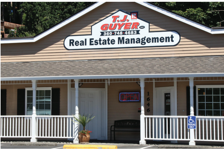
T.J. Guyer’s office, located at 1646 South Market Boulevard in Chehalis, is photographed in July, 2023.