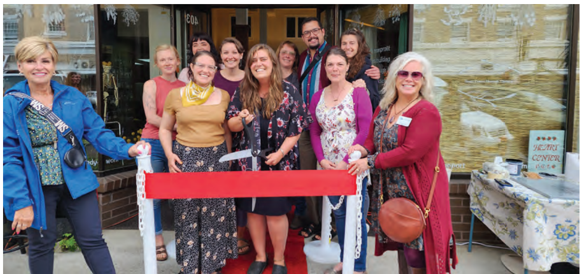
Nature Nurture Farmacy is located at 403 N. Market Blvd. #1., Chehalis Open Tuesday – Thursday 10 – 5 • Friday 10 – 3. • NatureNurtureFarmacy.org