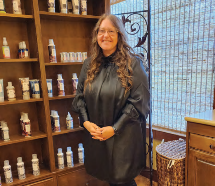
The Garage Hair Lounge is located at 1270 SW William in Chehalis. Visit thegaragehairlounge.com for details and scheduling.