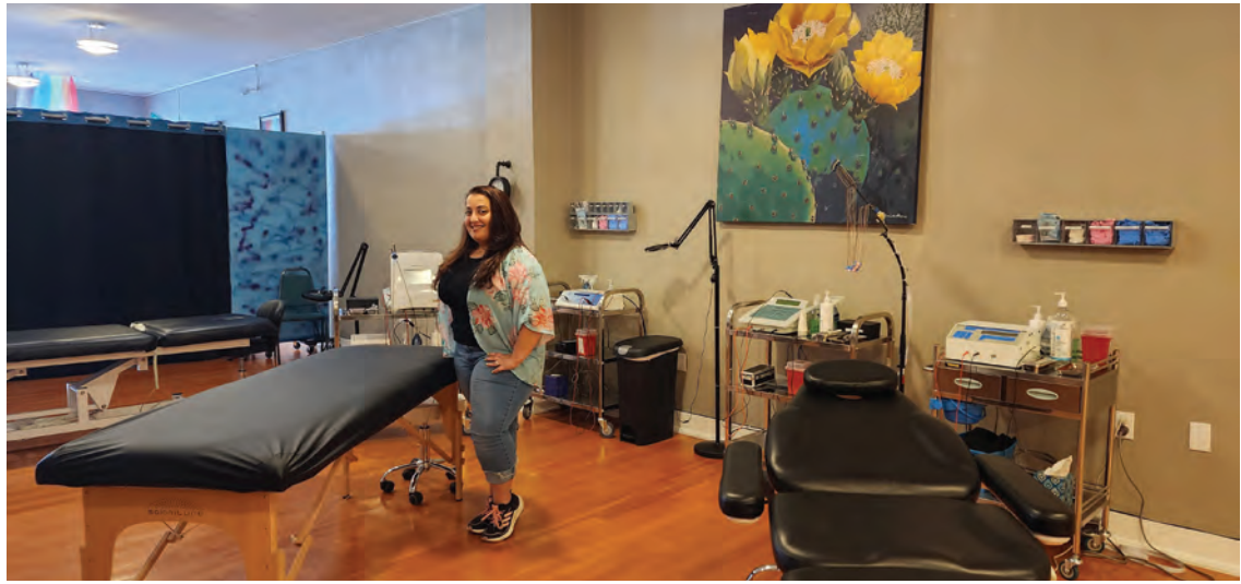
Zap Master is located at 108 N. Tower in Centralia. Visit thezapmaster.com to learn more.