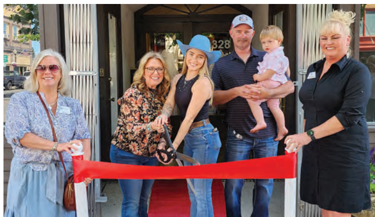
Ribbon Cutting Ceremonies that celebrate the opening, expansion, or change of ownership is a signature program of the Chamber. Shown here is the 2023 Ribbon Cutting for Saddle Bum in Centralia.

The Chamber regularly coordinates several events including managing the midway point for Seattle-to-Portland (STP) riders at Penny Park to its newly established 3-on-3 basketball tournament scheduled for August 5-6. The