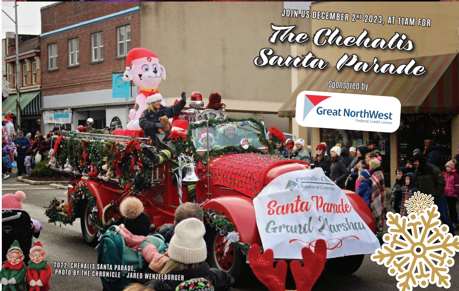
2022 CHEHALIS SANTA PARADE