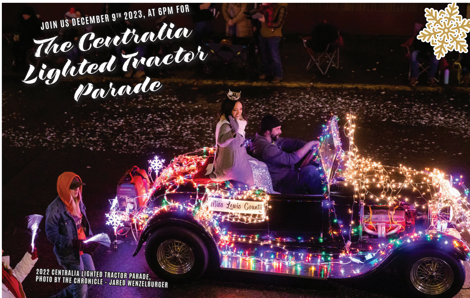
2022 CENTRALIA LIGHTED TRACTOR PARADE