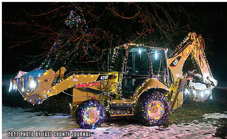
2022 PHOTO BY EAST COUNTY JOURNAL

East County is the gateway to winter fun, snow, and sparkling lights. Enjoy the holidays in the mountains with family events, shopping, skiing, and other outdoor activities in Morton, Packwood, and Stevens Pass.