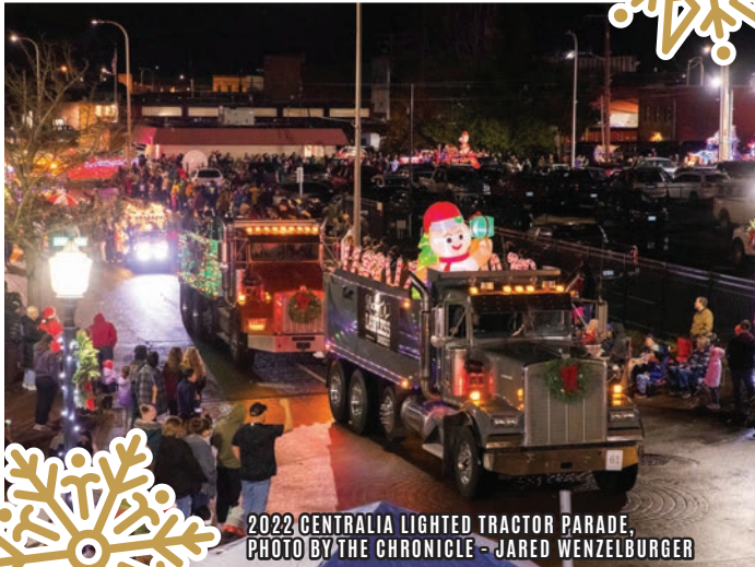
2022 CENTRALIA LIGHTED TRACTOR PARADE