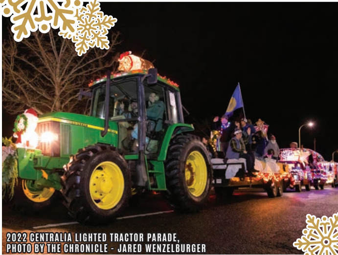
2022 CENTRALIA LIGHTED TRACTOR PARADE, PHOTO BY THE CHRONICLE - JARED WENZELBURGER