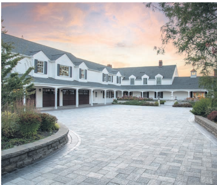
A finished project done by Eli's Paver Patios in Cooper Point.