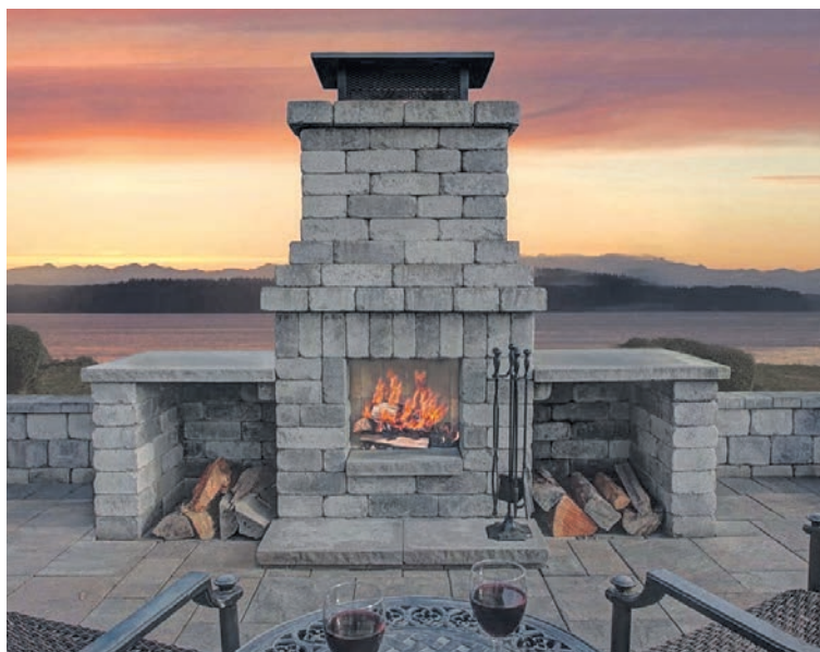
A finished fireplace installed by Eli's Paver Patios.