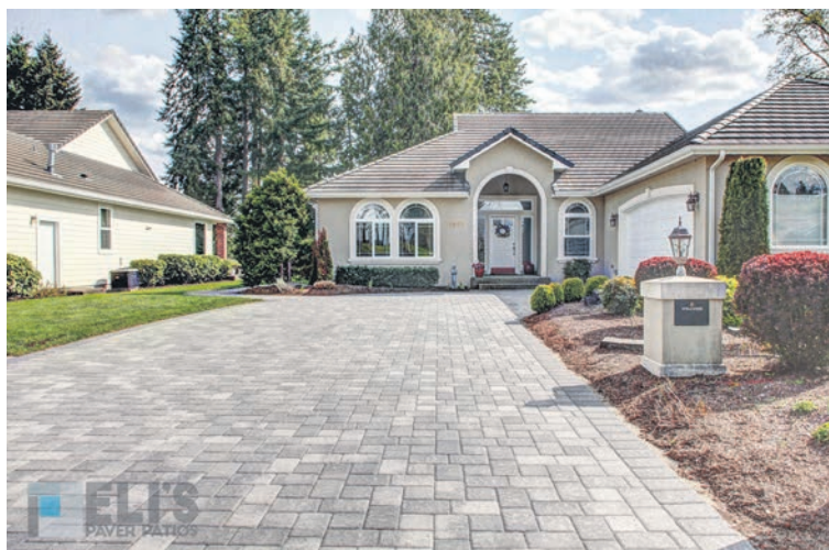
A finished project done by Eli's Paver Patios.

For more information on Eli's Paver Patios, visit https://elispaverpatios.com/ or https://www.facebook.com/elispaverpatios . Check out Eli's Pavers in-person at the 58th Annual Lewis County Home & Garden Show April 12 & 13!