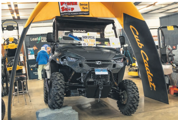
The Power Shop is back again with a display of their equipment.