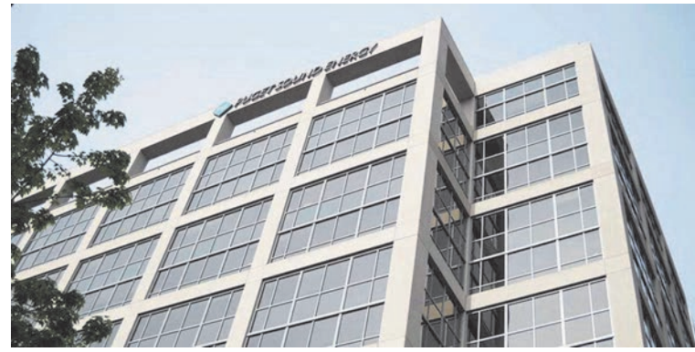
Puget Sound Energy’s headquarters in Bellevue.

For more information about Puget Sound Energy, visit https://www.pse.com/en .