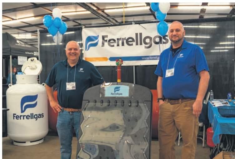
Ferrell Gas returns to the 2024 Home & Garden Show

58th Home & Garden Show Friday, April 12 from Noon to 6:30 pm Saturday, April 13 from 10:00 am to 5:00 pm Blue Pavilion at the SW Washington Fairgrounds 1909 S. Gold Street Centralia/Chehalis Come visit all the great vendors participating with even more to come!