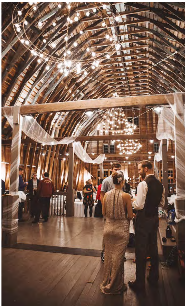
The Barn at Owl and Olive.

Visit owlolive.net to learn more about this unique venue.