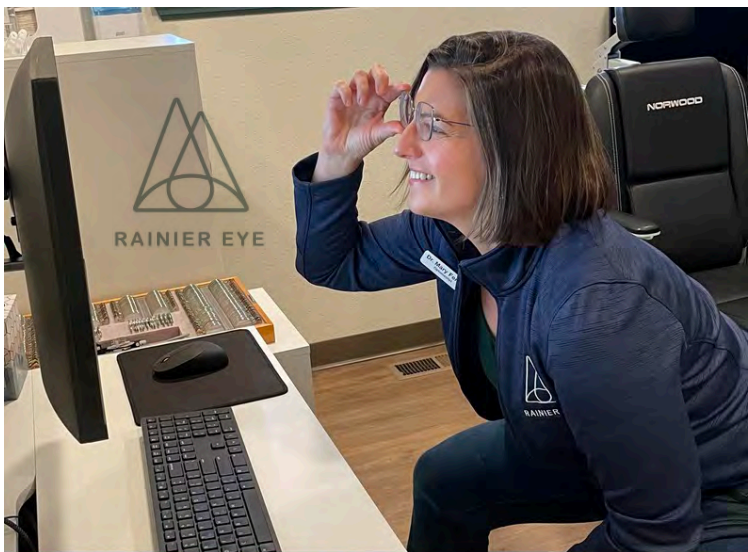
DON'T: Wear lenses that force you to lean in or tip your chin up to see clearly.