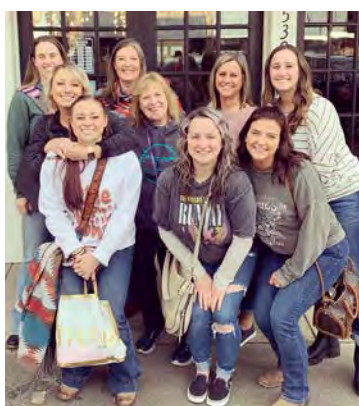
March 9 is Ladies Night in downtown Chehalis