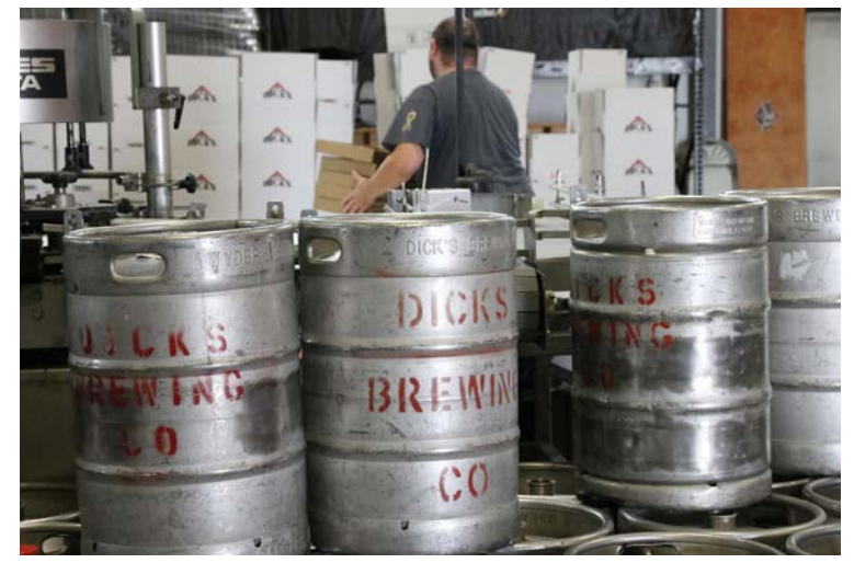
Barrels of beer sit inside Dick's Brewing Company's warehouse in Centralia on Monday, July 22.