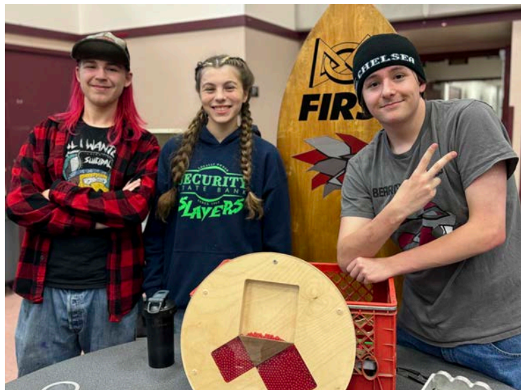
Chehalis School District Business After Hours was an incredible display of the talents of our future entrepreneurs. DECA has a wonderful coffee shop project they are doing, SkillsUSA is preparing students to enter the workforce, and so many teachers and the classes they offer allow the students to explore their talents, and gain confidence in their abilities.