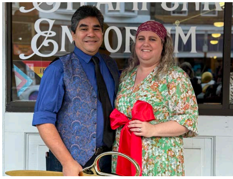
Victorian & Steampunk Emporium cut the ribbon and introduced us to a store filled with an incredible variety of collectibles, clothing, and more. Right in the heart of downtown Centralia, they are a fantastic addition to our creative local community.