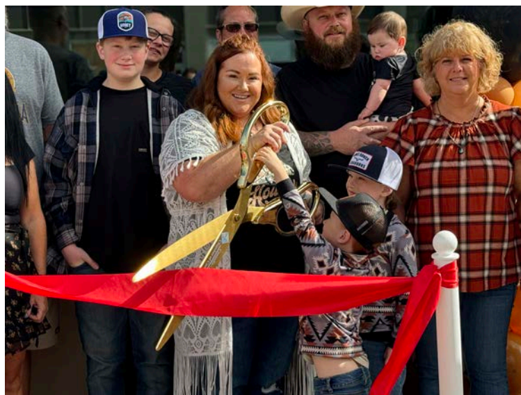
Country Chic Baby Co. was welcomed to our community with long lines and eager customers. Even before the ribbon was cut to officially open their store, there was a significant line of excited folks ready to get their country chic on. What was once a small, online-only business has now blossomed into a full-blown brick-and-mortar storefront.