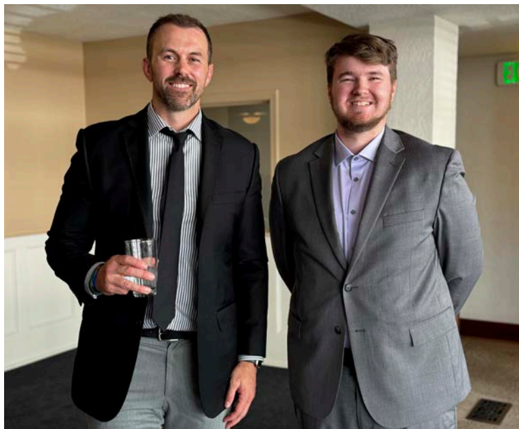
The Annual Chamber Debates hosted by O'Blarney's at The Gibson House started with a bang as our local current and future commissioners answered questions provided by The Chamber, as well as submissions from local community members.