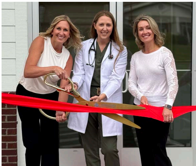
Wellness Pointe had a grand opening to remember, as they cut the ribbon in front of their beautiful new location on Kresky Ave. Friends and Family, as well as local council members, were thrilled to see the new direct care facility open its doors.