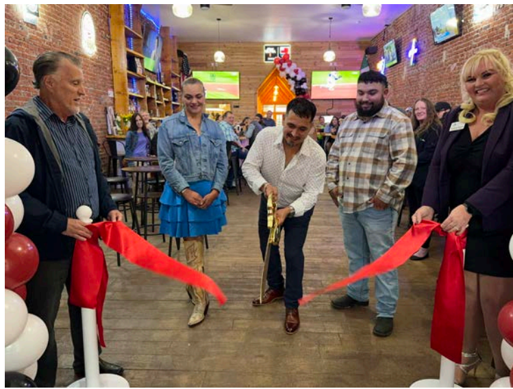
JJ's Sports Bar garnered wonderful community attendance as they officially cut the ribbon and opened their doors. They have done some major remodeling of the interior, and have worked so hard to get this place to be a welcoming addition to downtown Centralia. Every table was filled, and there was plenty of alcohol and food to go around.