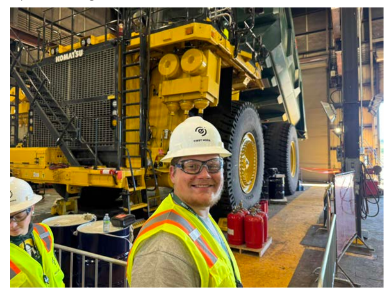
Centralia College Diesel Technology students visit a TransAlta plant in October.

A Centralia College Diesel Technology student works on a smoking engine as part of an assignment in October.