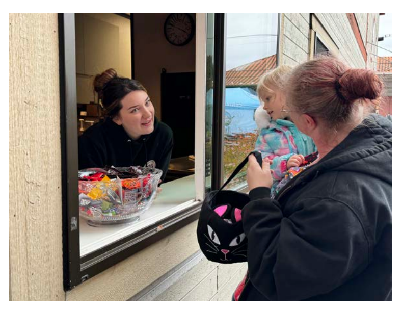
The Trick or Treat Transit was a success! Kids, parents, and business owners all had a blast receiving and giving out candy. A special thanks to Lewis County Transit and all of the businesses who participated.