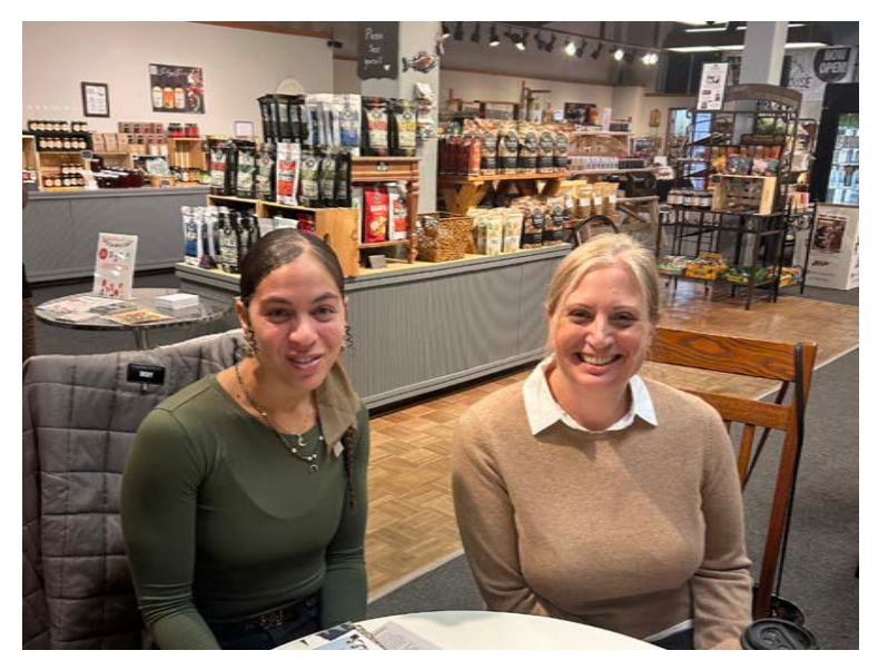
The Centralia-Chehalis Chamber of Commerce had a great turnout at our November Forum held at Northwest Salmon Smokehouse. Thank you to everyone who showed up and we hope to see you at our next forum in 2025!