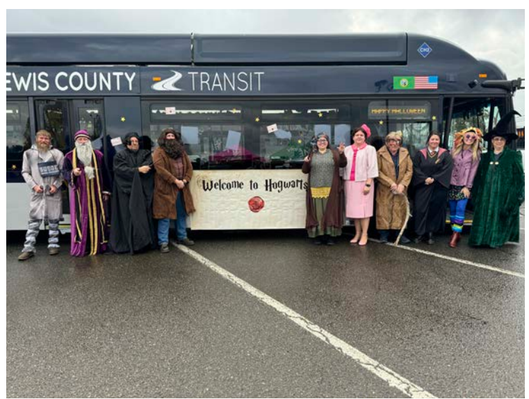
The Lewis County Transit crew spread halloween cheer in their Harry Potter themed costumes. Special thanks to L.C. Creamery for making this event a success!