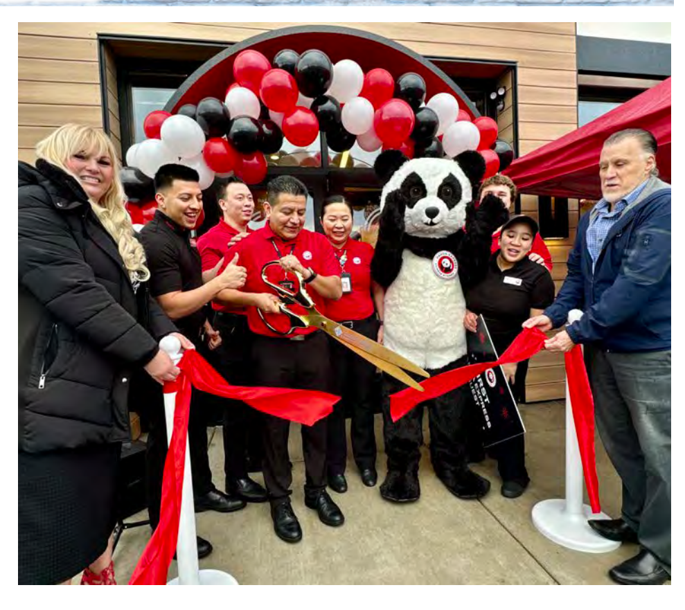
Panda Express opened its new location in Chehalis in January, drawing a large crowd to join in on the celebration.