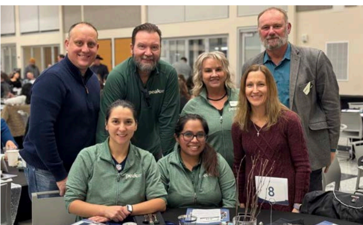
The team at Peak Credit Union.